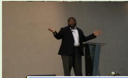
Preaching of Gospel