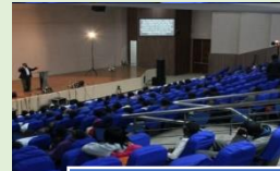
From every tribe