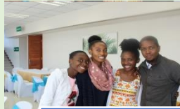
Lovers of souls