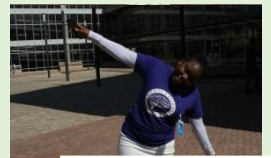
Fly high for Jesus