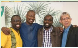
From different nations with one Mission