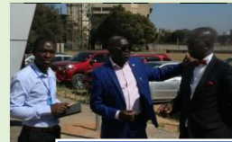
Teaming up for Jesus