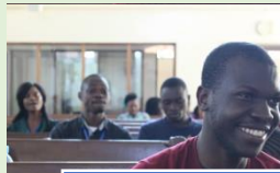
The joy of seeing one get baptised