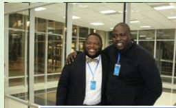
Gaints of the Lord