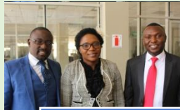
Reunion of Gospel workers