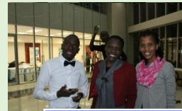
Fear and Near