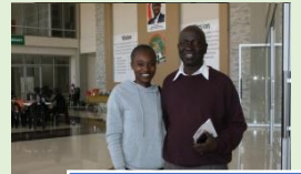
The young and the old