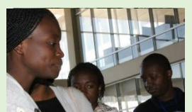
Focus on the missions