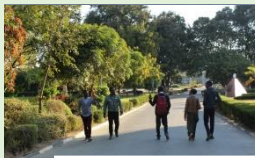
To the end of the Earth