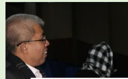
Learning New methods