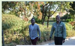
Go on God's errands