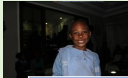
Children, come unto Me