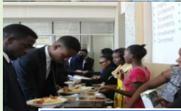
Come to the feast