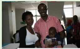
Mission & Marriage