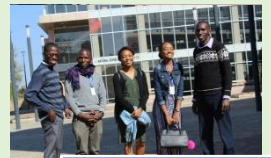
Charged to Go