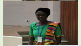
Teach of Gospel