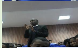
Questions and answers