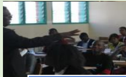
Sitting at the feet of Jesus