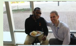
Make friends with God's children