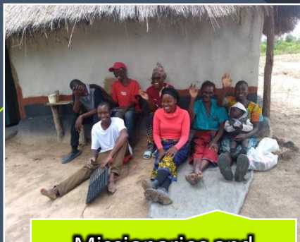
Missionaries and Clients pose for Photo