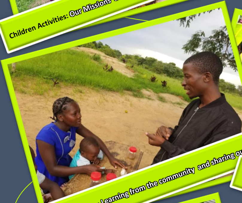
Sharing Knowledge: Learning from the community and sharing our remedies