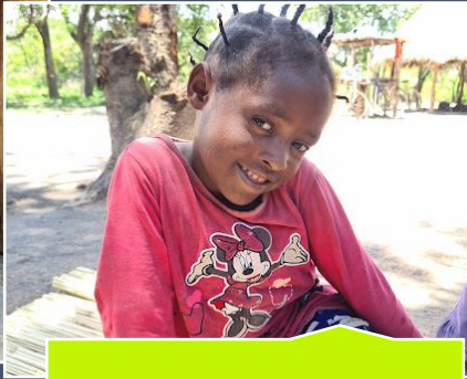
The Joy of His Word