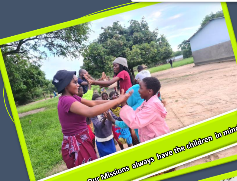
Children Activities: Our Missions always have the children in mind