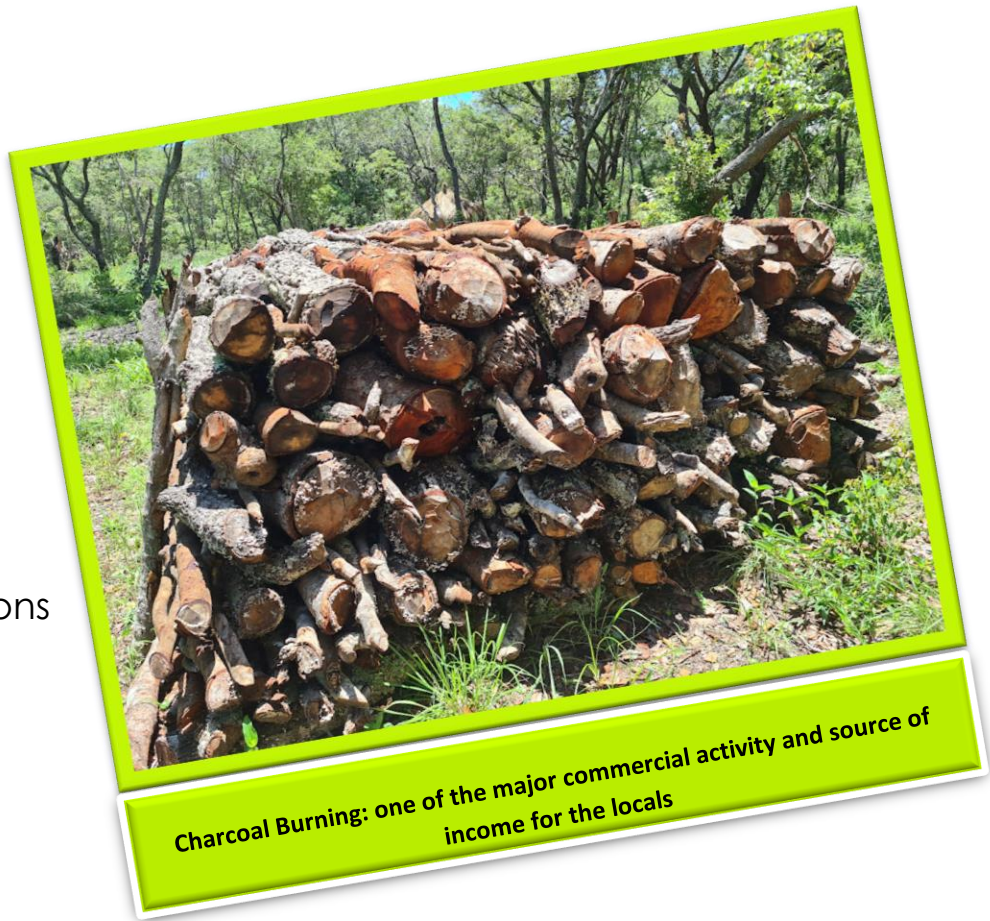
Charcoal Burning: one of the major commercial activity and source of income for the locals