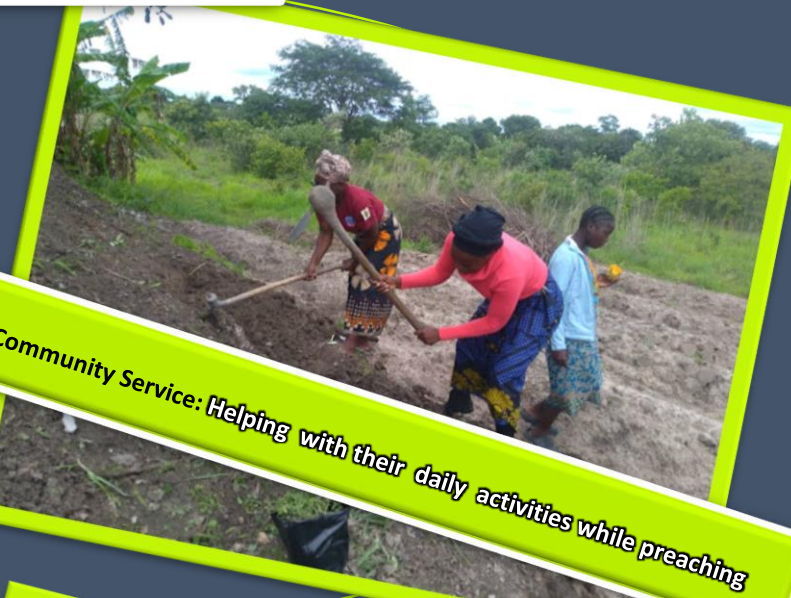
Community Service: Helping with their daily activities while preaching