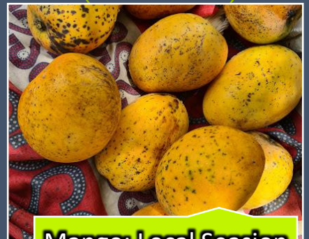
Mango: Local Season fruits in abundance