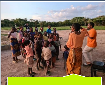
Reaching the children