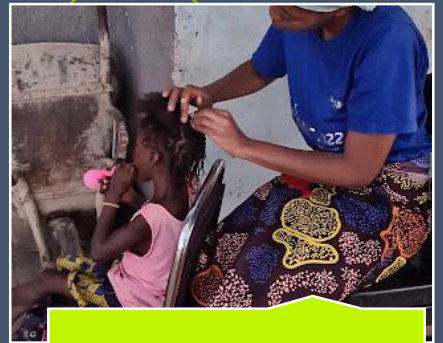
Helping while Sharing