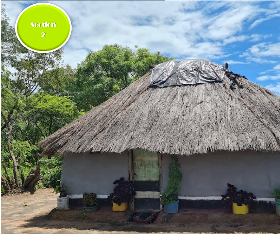
Ngabwe, Kabwe Rural , Central Province/Photo taken by IMPACT During Ngabwe Mission 2022 : Thatched roofed, mud house, plastered and paint with clay Local House