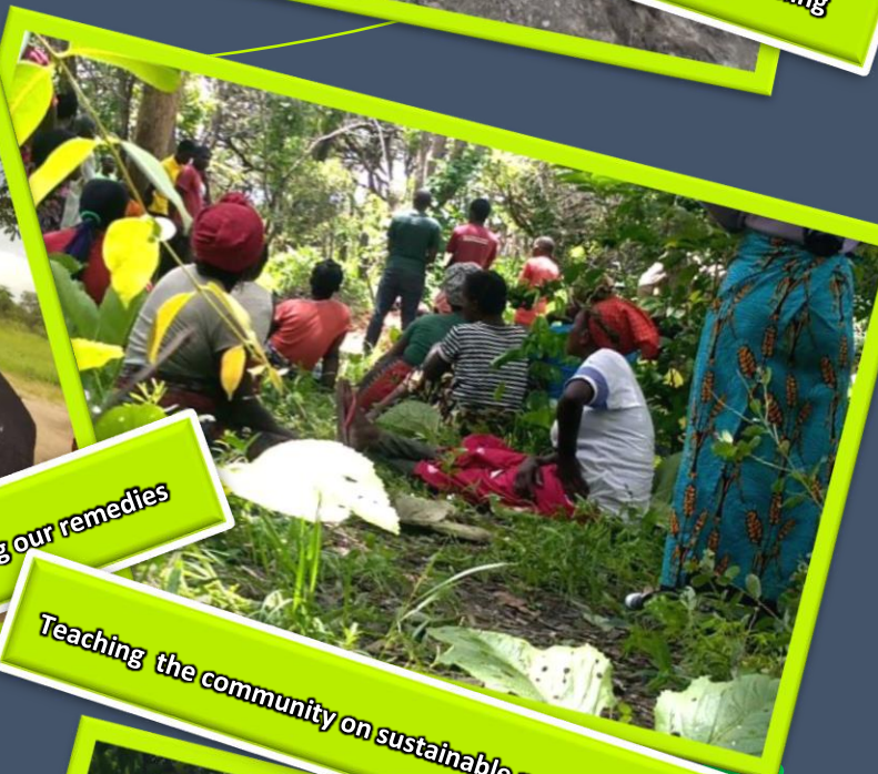
Teaching the community on sustainable methods of farming