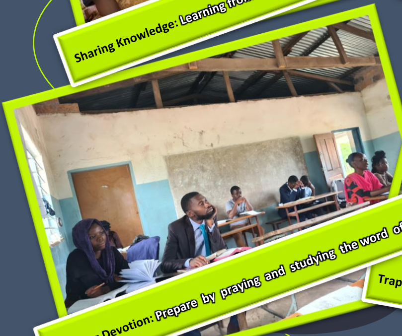
Morning Devotion: Prepare by praying and studying the word of God