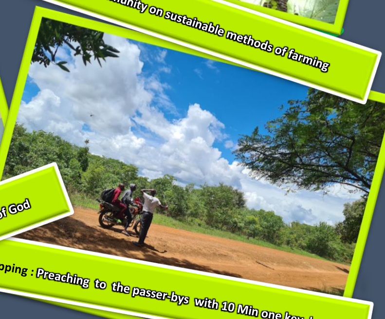
Trapping: Preaching to the passer-bys with 10 Min one key lesson