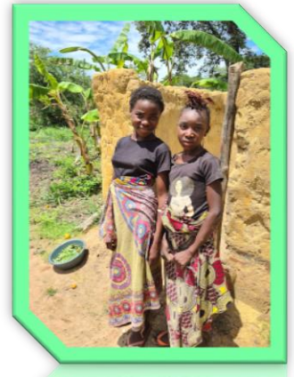
Young Ladies taught self-hygiene