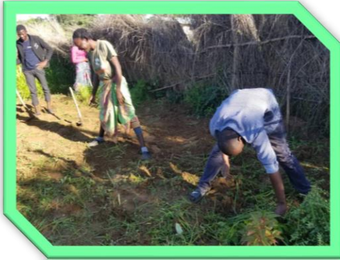
Missionaries Cleaning the Environments

With regard to sanitation, the assigned missionaries in charge of this department from each camp were to organize their fellow missionaries to ensure the environment was well taken care of. The overall report on this matter with regards to what was the missionaries control was that it was well taken care of, praise God. Sanitary and cleaning material were provided and basics lessons on sanitation were shared with both missionaries and locals.