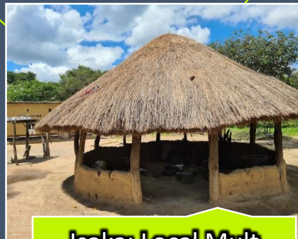
Isaka: Local Mult Purpose Shelter