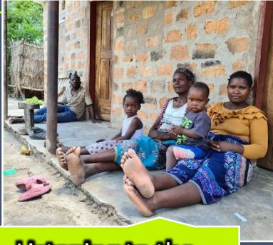
Listening to the Gospel