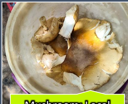
Mushroom; Local Food naturally grown