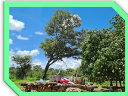
Indigenous drying utensils