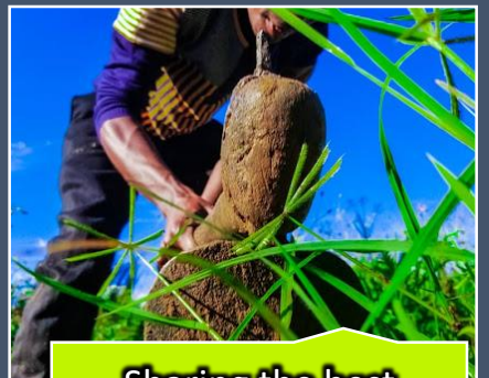
Sharing the best farming methods