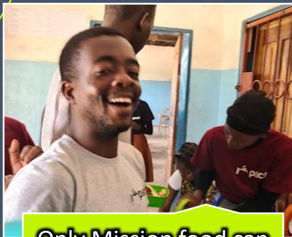
Only Mission food can give this kind of joy